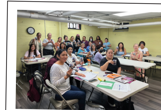
ESOL students Learn about and celebrate the Founder of the School Sisters of Notre Dame