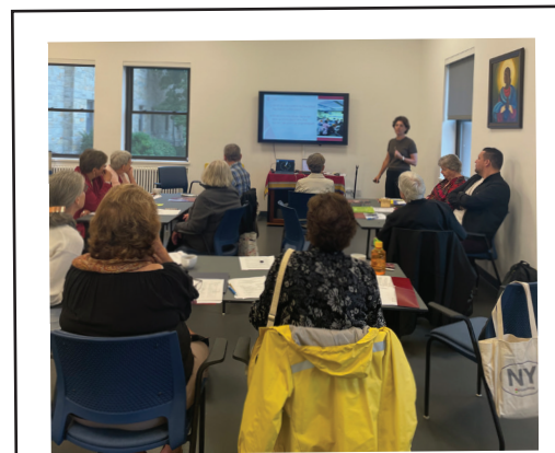
Members of the Board of Trustees and Staff gather for a full day work retreat.