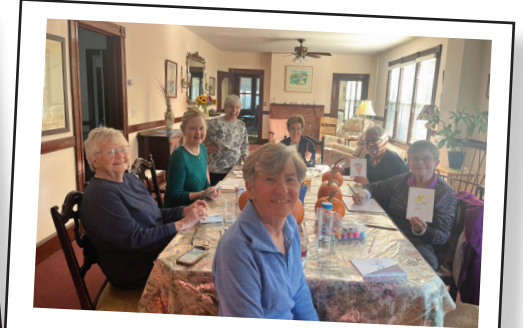
Members of the faculty enjoy a day of reflection and team building at the Quogue Home of the Sisters of Charity of Halifax